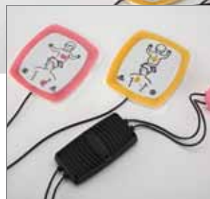
Infant/Child Reduced Energy Defibrillation Electrode Starter Kit

For use only with LIFEPAK 500 Biphasic AED with pink connector or LIFEPAK 1000 defibrillator, LIFEPAK EXPRESS® AED, or LIFEPAK CR® Plus AED. For use on children less than 8 years of age or under 55 lbs. 11101-000017