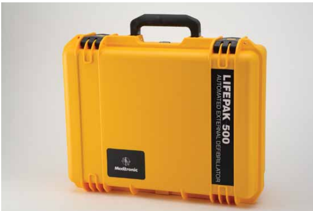
Hard Shell, Water-tight Carrying Case 11998-000021