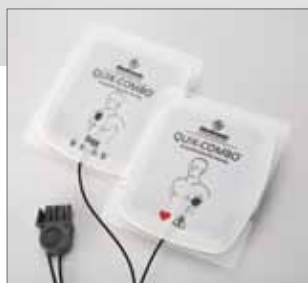
EDGE System Electrodes with QUIK-COMBO Connector and REDI-PAK™ Preconnect System 11996-000017