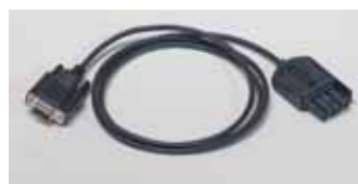
For Serial Connection 11230-000001

To transfer setup option configuration from unit to device for multiple unit systems. 11110-000050