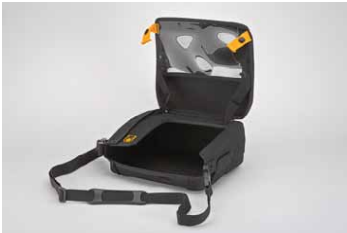
Complete Soft Shell Carrying Case 11998-000014

AED Professionals is a Certified Authorized Medtronic-Physio Control Dealer. Please call 1-888-541-2337 or visit us at www.aedprofessionals.com to buy your Lifepak 500 Accessories