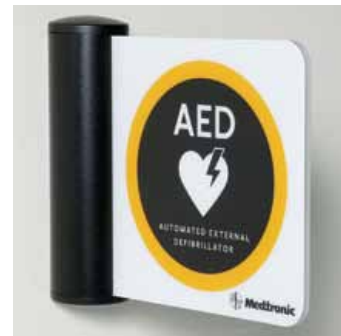
AED Location Sign T-mount, 8" x 8", with logo 11210-000031