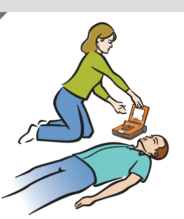
Place AED on ground. Open lid.