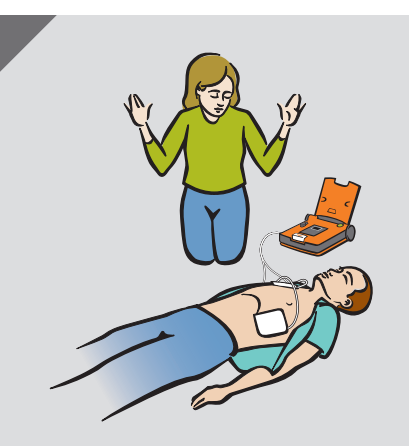
Do not touch the patient.