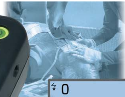
Chest compression depth gauge